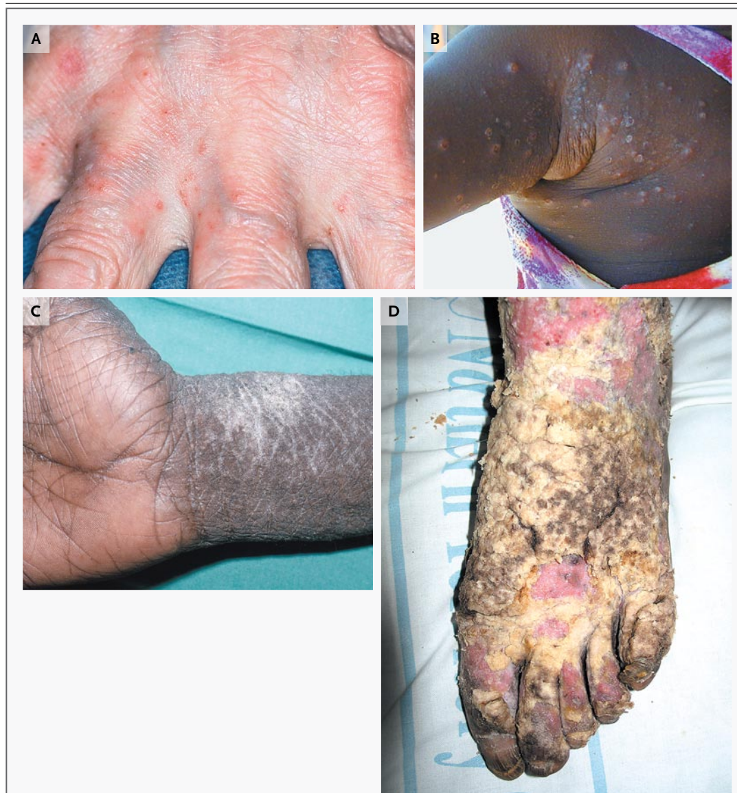
Figure 2. Manifestations of Scabies.

Interdigital lesions are a typical manifestation of classic scabies (Panel A). A pattern of excoriations and pustules in the axilla is characteristic of scabies with secondary bacterial infection (Panel B). Crusted scabies can be manifested as excoriations, lichenified skin on the wrists and hands (Panel C). A case of severe crusted scabies can result in sloughing of layers of thick, hyperkeratotic skin, with fissures that can result in secondary bacterial infection and the potential for bacteremia and systemic sepsis (Panel D). Panel A reprinted from Chosidow. 2